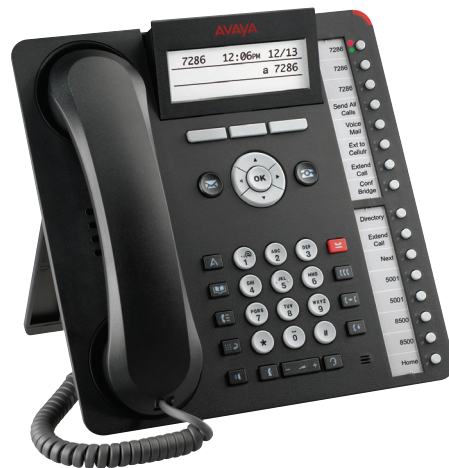
1616-I IP Deskphone

To learn more about the Avaya 1600 Series IP Deskphones, contact your Avaya Account Manager, Authorized Partner or visit avaya.com for white papers, case studies and other information showcasing Avaya solutions in action.